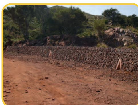
Figure 17.4 Traditional dry stone walls made close to the proposed PMR 'Ets Alocs' (Minorca, Balearic Islands) to avoid uncontrolled car parking near the riverine vegetation of Vitex agnus-castus.

which include among other interesting plant communities riparian thickets of Vitex agnus-castus . Pedestrian access redirection, which prevents the dispersal of visitors across PMRs has also been implemented in several PLANTNET-CY LIFE project areas in Cyprus.