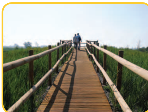
Figure 17.3 A wooden path crosses over the PMR 'Marjal dels Borrons' (Xeresa, Valencian Community) to allow the development of educational and recreative activities.